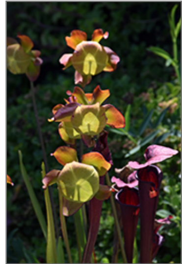
Conversation Piece Pitcher Plant flowers