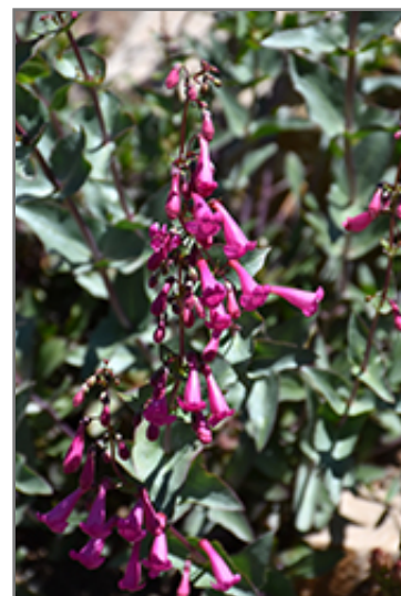
Sunset Crater Penstemon flowers