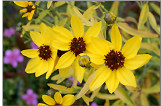
Lightning Flash Tickseed flowers

Lightning Flash Tickseed is recommended for the following landscape applications;