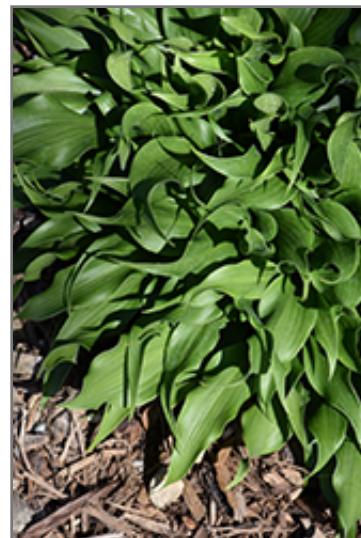
Tongue Twister Hosta foliage