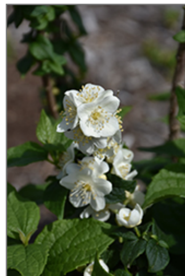
Illuminati Tower Mockorange flowers