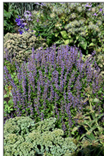
Blue Bayou Anise Hyssop in bloom