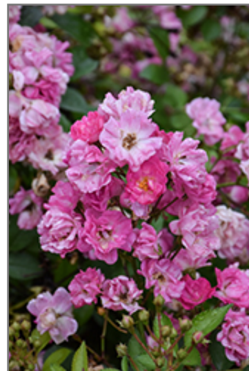
Pretty Polly Pink Rose flowers

Pretty Polly Pink Rose is recommended for the following landscape applications;