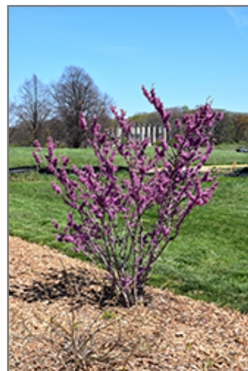
Celestial Plum Redbud in bloom

Celestial Plum Redbud is recommended for the following landscape applications;