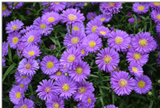
Magic Purple Aster flowers