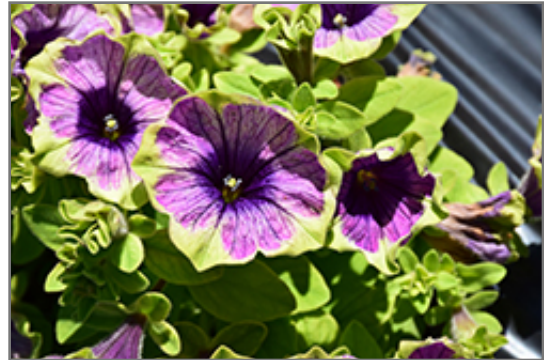
Surprise Green Tambourine Petunia flowers

This plant will require occasional maintenance and upkeep. Trim off the flower heads after they fade and die to encourage more blooms late into the season. It is a good choice for attracting butterflies and hummingbirds to your yard, but is not particularly attractive to deer who tend to leave it alone in favor of tastier treats. It has no significant negative characteristics.