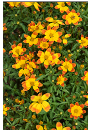
Bidy Boom Red Bidens flowers

Bidy Boom Red Bidens is recommended for the following landscape applications;