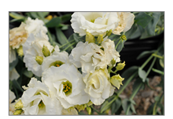
Echo Pure White Lisianthus flowers