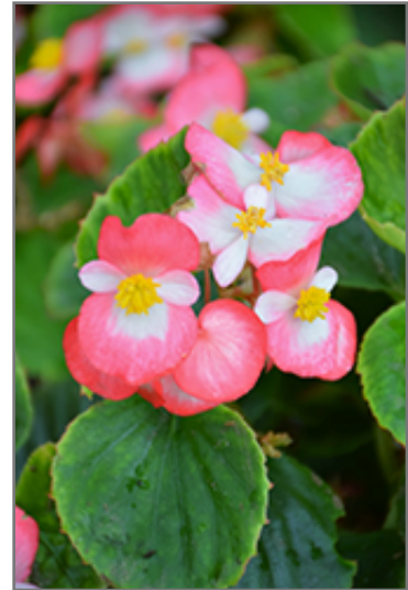
Bada Bing Rose Bicolor Begonia flowers