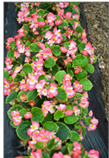
Bada Bing Rose Bicolor Begonia in bloom