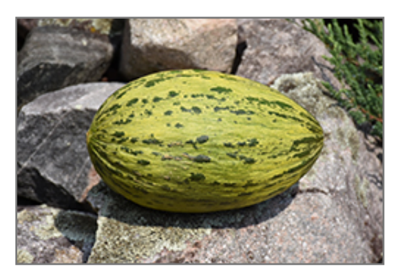
Sancho Melon fruit

Sancho Melon will grow to be about 24 inches tall at maturity, with a spread of 6 feet. When planted in rows, individual plants should be spaced approximately 24 inches apart. This vegetable plant is an annual, which means that it will grow for one season in your garden and then die after producing a crop.