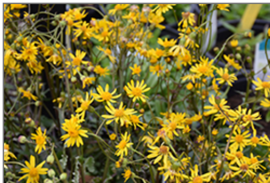
Golden Ragwort flowers

Golden Ragwort is a fine choice for the garden, but it is also a good selection for planting in outdoor pots and containers. With its upright habit of growth, it is best suited for use as a 'thriller' in the 'spiller-thriller-filler' container combination; plant it near the center of the pot, surrounded by smaller plants and those that spill over the edges. Note that when growing plants in outdoor containers and baskets, they may require more frequent waterings than they would in the yard or garden.