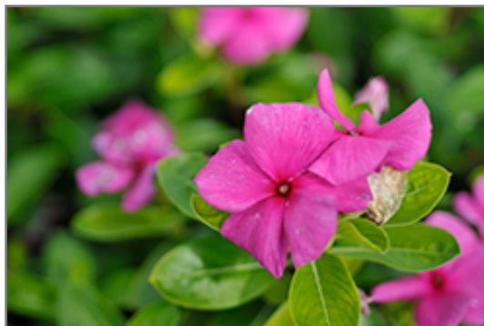
Pacifica XP Lilac Vinca flowers

This plant will require occasional maintenance and upkeep, and should not require much pruning, except when necessary, such as to remove dieback. It is a good choice for attracting butterflies to your yard, but is not particularly attractive to deer who tend to leave it alone in favor of tastier treats. It has no significant negative characteristics.