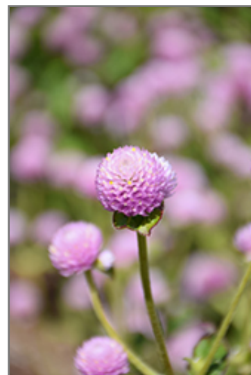
Gnome Pink Gomphrena flowers

This plant will require occasional maintenance and upkeep. Trim off the flower heads after they fade and die to encourage more blooms late into the season. It is a good choice for attracting bees and butterflies to your yard. It has no significant negative characteristics.