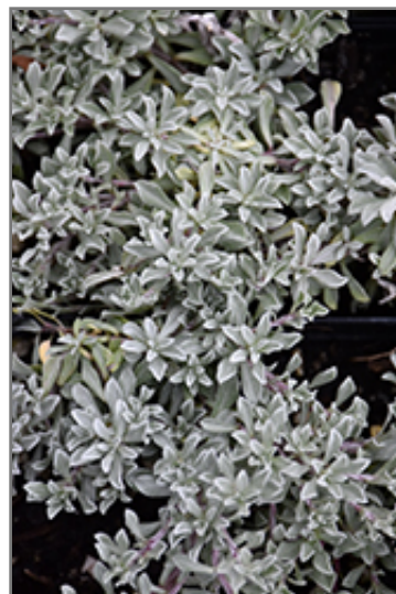
McClintock Pussytoes foliage