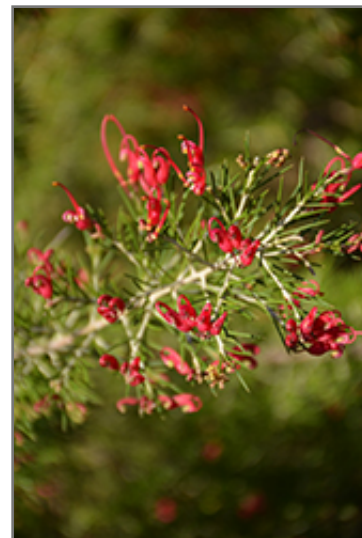
Wilson's Grevillea flowers

This is a relatively low maintenance shrub, and should only be pruned after flowering to avoid removing any of the current season's flowers. It is a good choice for attracting birds and butterflies to your yard, but is not particularly attractive to deer who tend to leave it alone in favor of tastier treats. Gardeners should be aware of the following characteristic(s) that may warrant special consideration;