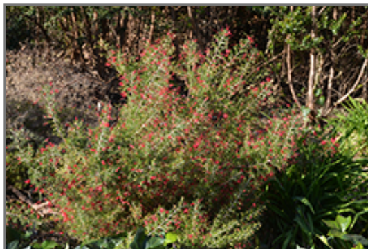
Wilson's Grevillea in bloom

This shrub does best in full sun to partial shade. It does best in average to evenly moist conditions, but will not tolerate standing water. It is not particular as to soil type or pH. It is somewhat tolerant of urban pollution. Consider applying a thick mulch around the root zone in winter to protect it in exposed locations or colder microclimates. This species is not originally from North America.