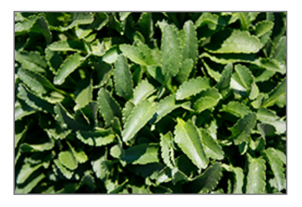
Vespers Blue Speedwell foliage