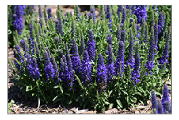
Vespers Blue Speedwell flowers

Vespers Blue Speedwell is recommended for the following landscape applications;