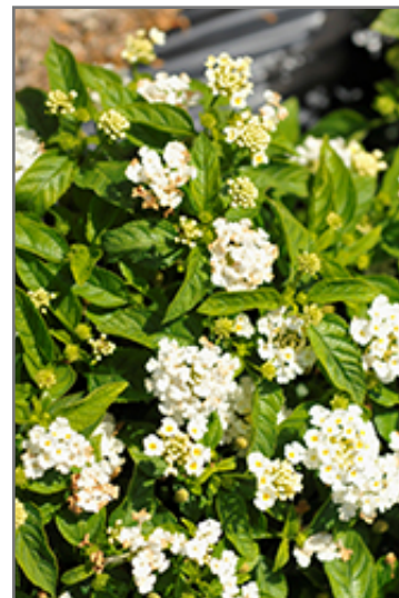
Gem Compact White Sapphire Lantana flowers

Gem Compact White Sapphire Lantana is recommended for the following landscape applications;