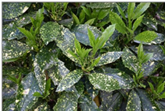
Subaru Aucuba foliage