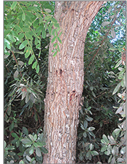
Tipu Tree bark

This tree does best in full sun to partial shade. It is very adaptable to both dry and moist locations, and should do just fine under average home landscape conditions. It is not particular as to soil type, but has a definite preference for acidic soils, and is able to handle environmental salt. It is somewhat tolerant of urban pollution. This species is not originally from North America..