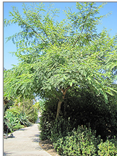
Tipu Tree

Tipu Tree is recommended for the following landscape applications;