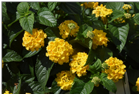
Lucky Yellow Lantana flowers

Lucky Yellow Lantana is recommended for the following landscape applications;