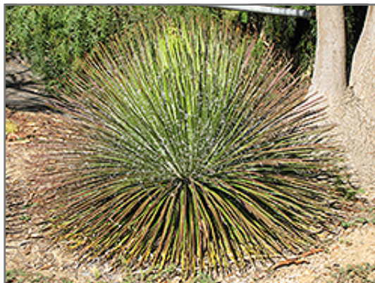
Narrowleaf Yucca

Narrowleaf Yucca is recommended for the following landscape applications;