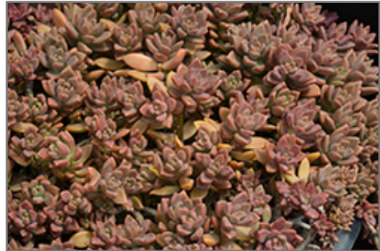
Vera Higgins Graptosedum

Vera Higgins Graptosedum is a dense herbaceous evergreen perennial with an upright spreading habit of growth. Its medium texture blends into the garden, but can always be balanced by a couple of finer or coarser plants for an effective composition.