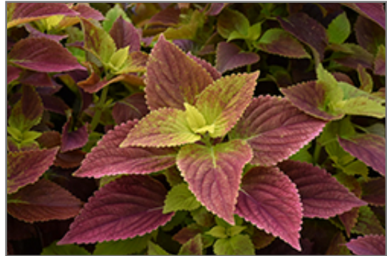
Alabama Sunset Coleus foliage