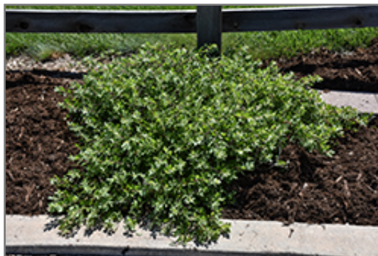
Autumn Amber Creeping Sumac

This shrub does best in full sun to partial shade. It is very adaptable to both dry and moist growing conditions, but will not tolerate any standing water. It is considered to be drought-tolerant, and thus makes an ideal choice for a low-water garden or xeriscape application. It is not particular as to soil type or pH. It is highly tolerant of urban pollution and will even thrive in inner city environments. This is a selection of a native North American species.