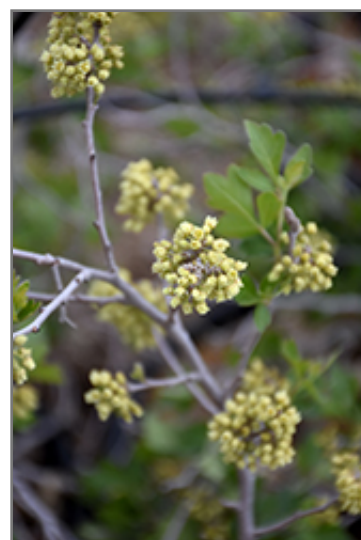
Autumn Amber Creeping Sumac flowers