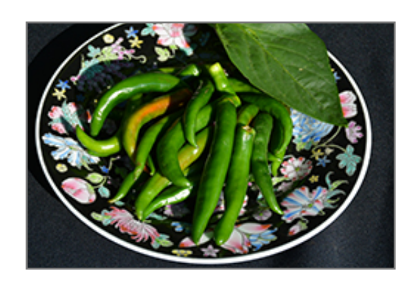
Crackle Hot Pepper fruit

Crackle Hot Pepper will grow to be about 24 inches tall at maturity, with a spread of 18 inches. When planted in rows, individual plants should be spaced approximately 18 inches apart. This vegetable plant is an annual, which means that it will grow for one season in your garden and then die after producing a crop.