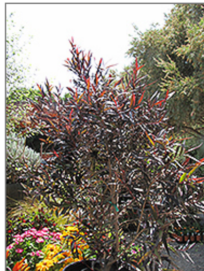
Aftershock Agonis

Aftershock Agonis is recommended for the following landscape applications;