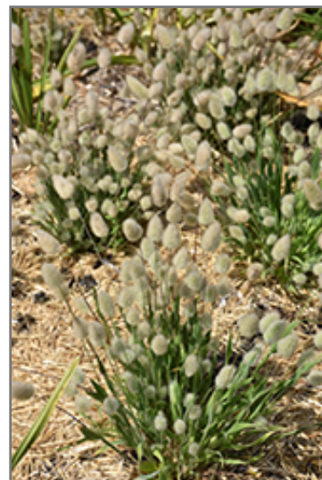
Bunny Tails Grass in bloom