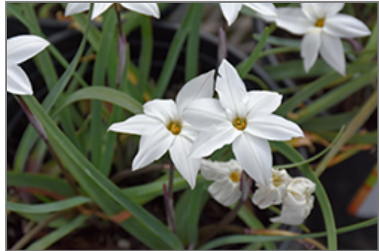
Alberto Castillo Spring Starflower flowers

Alberto Castillo Spring Starflower is recommended for the following landscape applications;