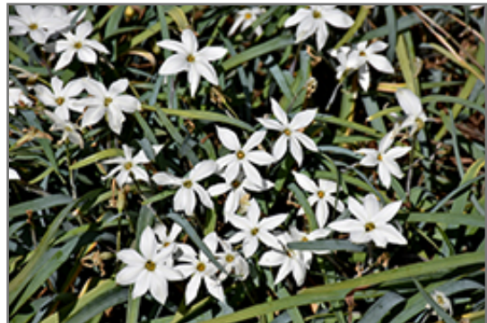
Alberto Castillo Spring Starflower flowers