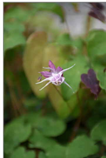
Dark Beauty Bishop's Hat flowers