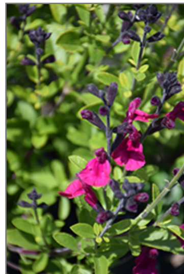
Vibe Ignition Fuchsia Sage flowers

Vibe Ignition Fuchsia Sage is a fine choice for the garden, but it is also a good selection for planting in outdoor pots and containers. With its upright habit of growth, it is best suited for use as a 'thriller' in the 'spiller-thriller-filler' container combination; plant it near the center of the pot, surrounded by smaller plants and those that spill over the edges. Note that when growing plants in outdoor containers and baskets, they may require more frequent waterings than they would in the yard or garden.