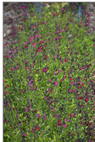
Vibe Ignition Fuchsia Sage in bloom