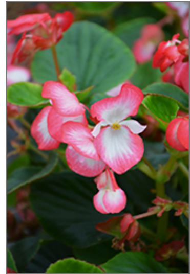
Volumia Rose Bicolor Begonia flowers

This is a high maintenance plant that will require regular care and upkeep, and usually looks its best without pruning, although it will tolerate pruning. Deer don't particularly care for this plant and will usually leave it alone in favor of tastier treats. Gardeners should be aware of the following characteristic(s) that may warrant special consideration;