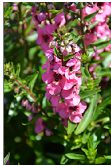
Serena Rose Angelonia flowers

Serena Rose Angelonia is recommended for the following landscape applications;