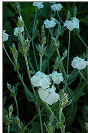
White Rose Campion flowers