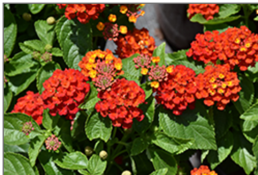
Hot Blooded Red Lantana flowers

This is a relatively low maintenance shrub, and should not require much pruning, except when necessary, such as to remove dieback. It is a good choice for attracting butterflies and hummingbirds to your yard, but is not particularly attractive to deer who tend to leave it alone in favor of tastier treats. It has no significant negative characteristics.