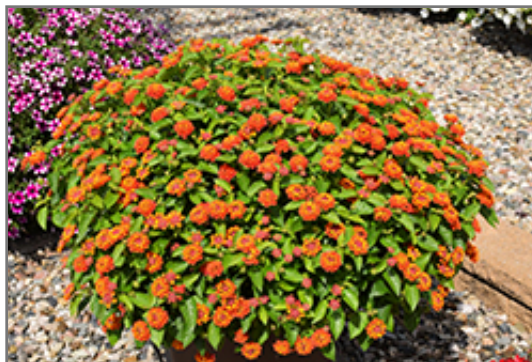
Hot Blooded Red Lantana in bloom

Hot Blooded Red Lantana makes a fine choice for the outdoor landscape, but it is also well-suited for use in outdoor containers and hanging baskets. It is often used as a 'filler' in the 'spiller-thriller-filler' container combination, providing a mass of flowers against which the thriller plants stand out. Note that when grown in a container, it may not perform exactly as indicated on the tag - this is to be expected. Also note that when growing plants in outdoor containers and baskets, they may require more frequent waterings than they would in the yard or garden.