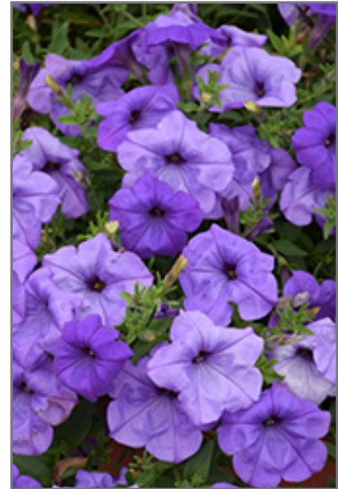
Evening Scentsation Petunia flowers

This plant will require occasional maintenance and upkeep. Trim off the flower heads after they fade and die to encourage more blooms late into the season. It is a good choice for attracting butterflies and hummingbirds to your yard, but is not particularly attractive to deer who tend to leave it alone in favor of tastier treats. It has no significant negative characteristics.