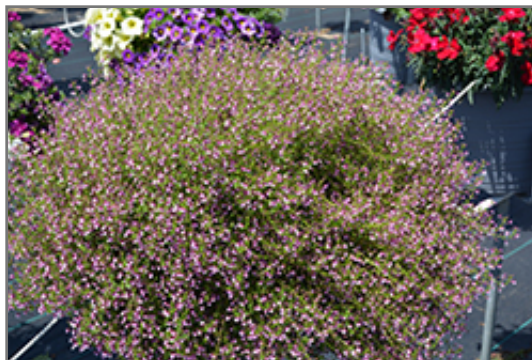
Pink Shimmer Cuphea in bloom

Pink Shimmer Cuphea will grow to be about 16 inches tall at maturity, with a spread of 16 inches. When grown in masses or used as a bedding plant, individual plants should be spaced approximately 12 inches apart. Its foliage tends to remain dense right to the ground, not requiring facer plants in front. Although it's not a true annual, this plant can be expected to behave as an annual in our climate if left outdoors over the winter, usually needing replacement the following year. As such, gardeners should take into consideration that it will perform differently than it would in its native habitat.