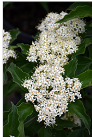
Rough-leaved Dogwood flowers

Rough-leaved Dogwood is recommended for the following landscape applications;