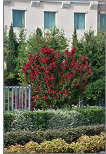
Double Dynamite Crapemyrtle in bloom

This shrub does best in full sun to partial shade. It prefers to grow in average to moist conditions, and shouldn't be allowed to dry out. It is very fussy about its soil conditions and must have rich, acidic soils to ensure success, and is subject to chlorosis (yellowing) of the foliage in alkaline soils. It is highly tolerant of urban pollution and will even thrive in inner city environments. This is a selected variety of a species not originally from North America.