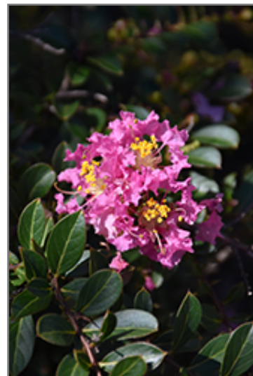
Princess Lyla Crapemyrtle flowers