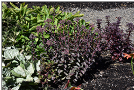
Raspberry Truffle Stonecrop in bloom

Raspberry Truffle Stonecrop is a dense herbaceous perennial with an upright spreading habit of growth. Its medium texture blends into the garden, but can always be balanced by a couple of finer or coarser plants for an effective composition.