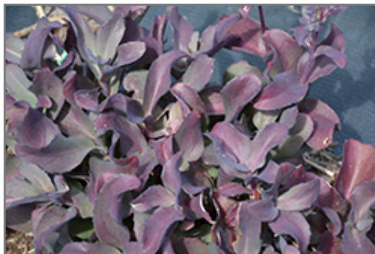
Raspberry Truffle Stonecrop foliage