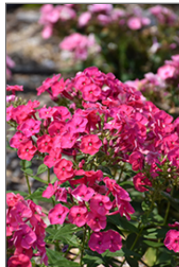
Ka-Pow Pink Garden Phlox flowers