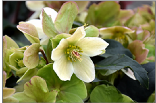
HGC Winter's Bliss Hellebore flowers