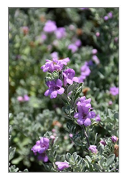
Desperado Texas Sage flowers

Desperado Texas Sage is a multi-stemmed evergreen shrub with an upright spreading habit of growth. Its relatively fine texture sets it apart from other landscape plants with less refined foliage.