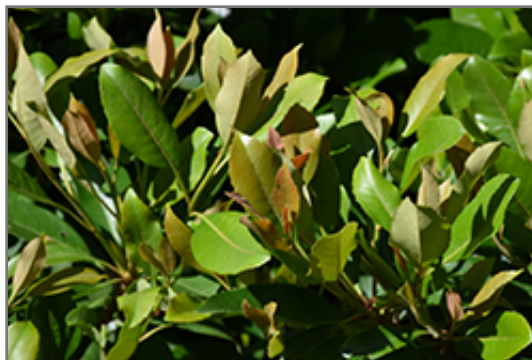
Coppertone Loquat foliage