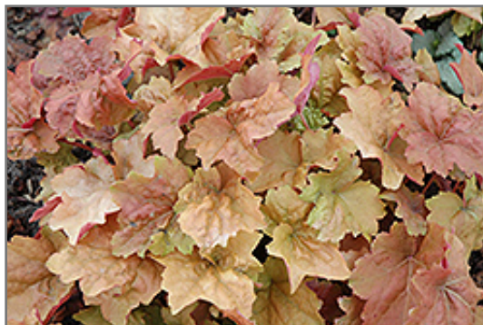
Dolce Creme Brulee Coral Bells foliage

Dolce Creme Brulee Coral Bells is recommended for the following landscape applications;