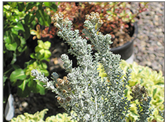
Silver Cape Ozothamnus foliage