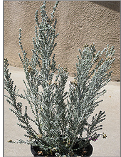
Silver Cape Ozothamnus

Silver Cape Ozothamnus is recommended for the following landscape applications;